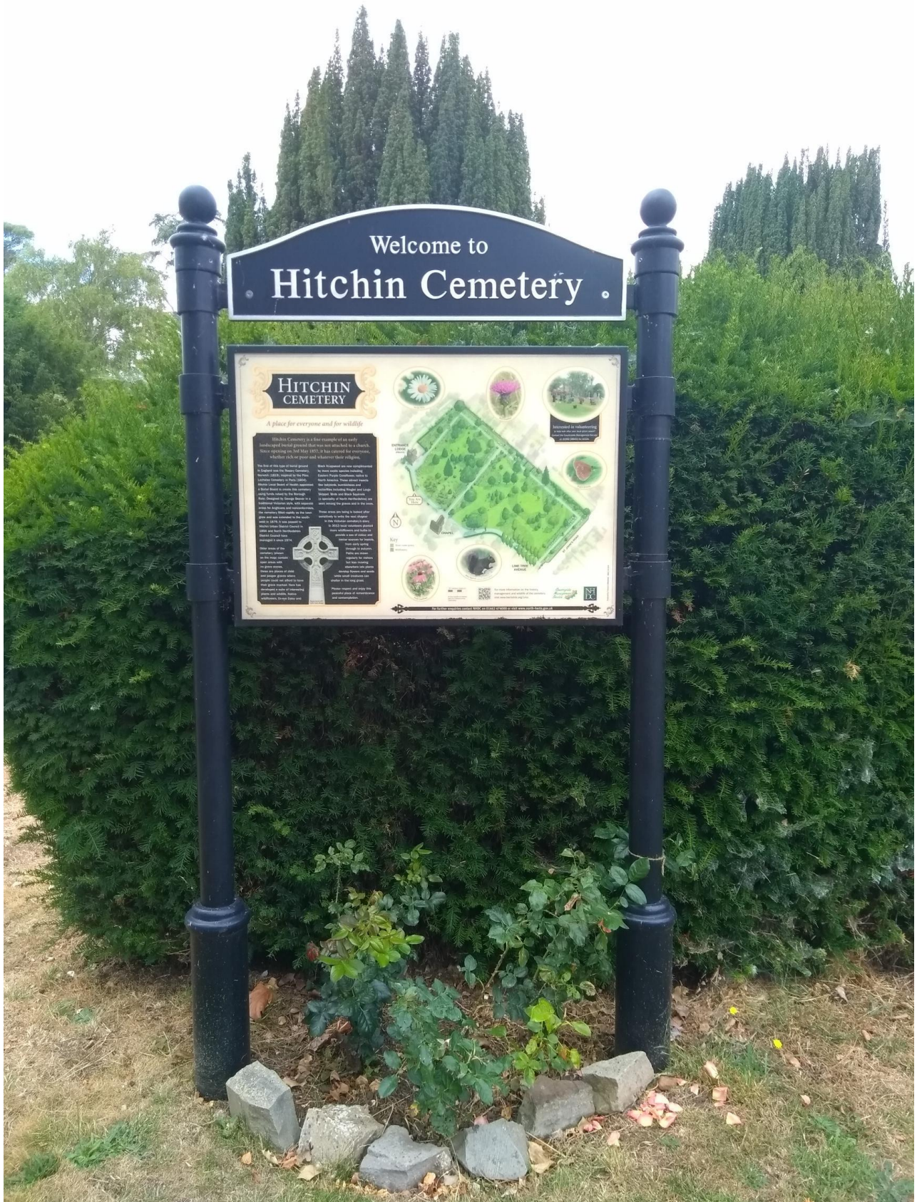
Hitchin Cemetery

Hitchin Cemetery, Hitchin, Hertfordshire contains 61 Commonwealth War Graves – 31 relating to World War 1 & 30 from World War 2.