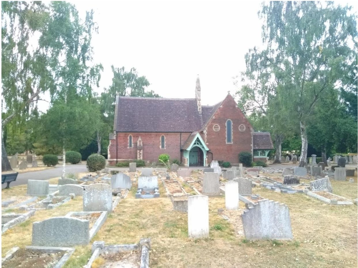
Hitchin Cemetery